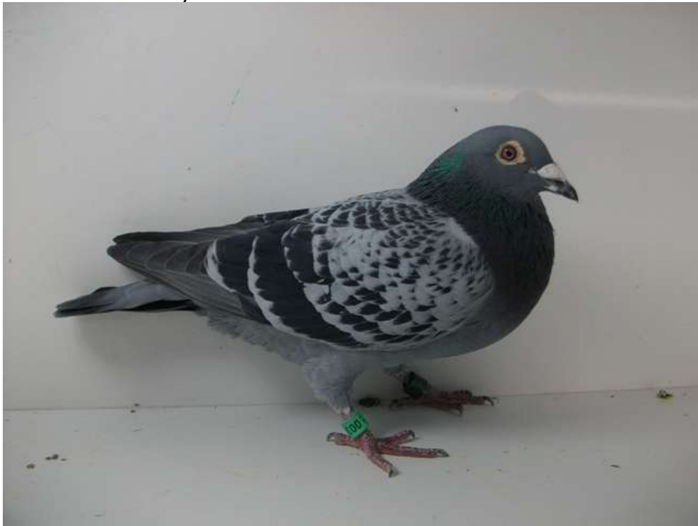
Picture of SA 09 00397 BCC-Ugly Son, who has been a consistent performer the past two seasons for us.