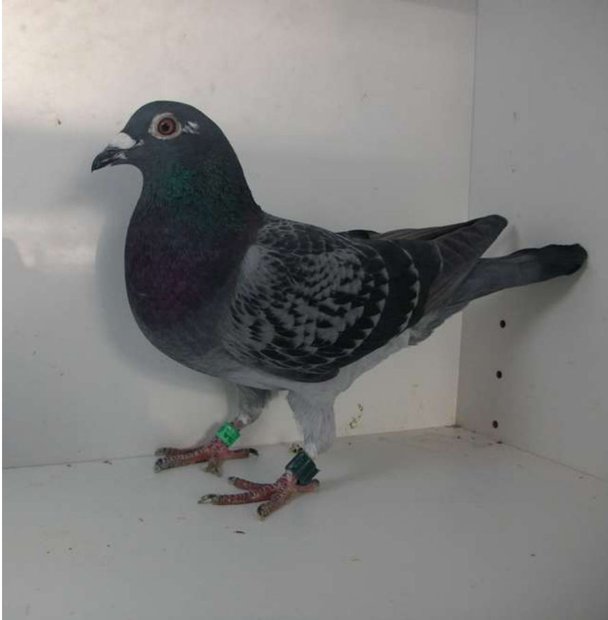
Picture of SA 09 00457 BCPH 8 th SAHPA Parachilna Open against 4627 birds.