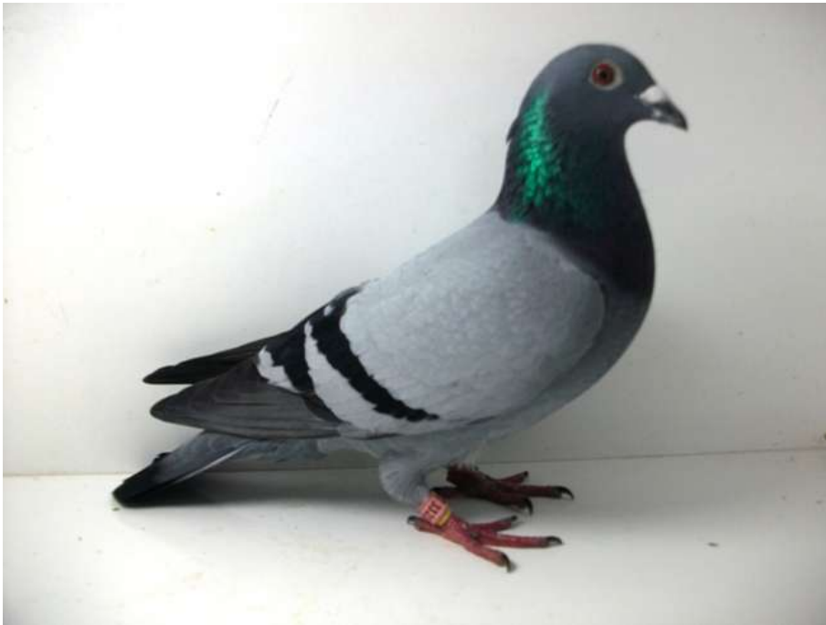
Picture of Master Luke the winner from Edenhope.