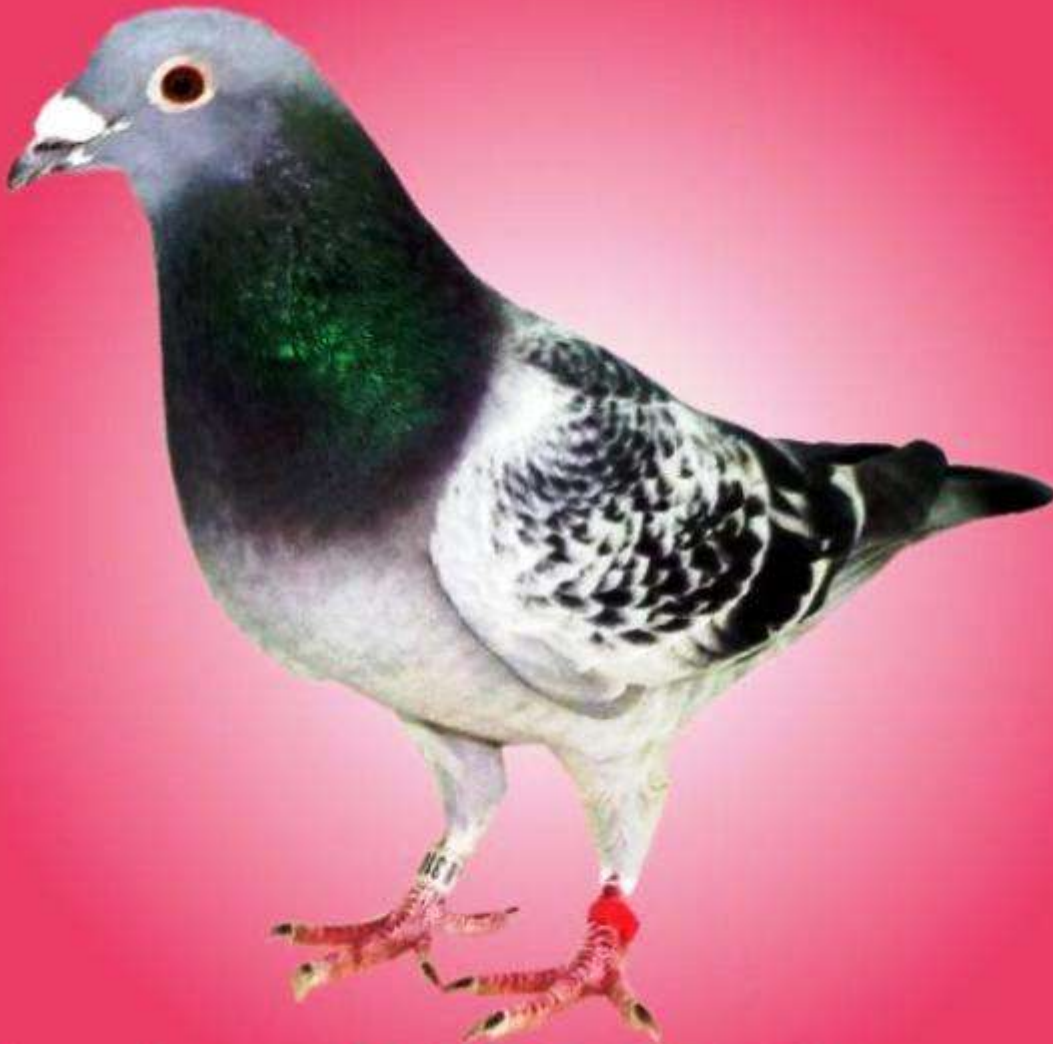
Houben 3107 Cock

Blue Ring Brother & Double Jewel Euro Pair 6.